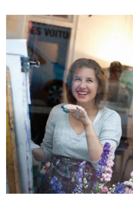
Enjoy an art activity on day 5